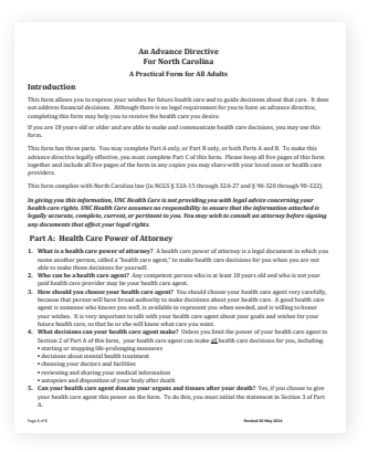
North Carolina Advance Directive

There is another version of an advance care planning document that may be of interest to you as it combines the two kinds of forms above. We are happy to provide you with a copy upon request or you may access it online.