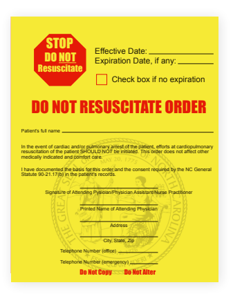
Do Not Resuscitate (DNR)

whether you want CPR, use of a breathing machine or ventilator, levels of care for other medical interventions, antibiotics, and artificial hydration or nutrition. It must be signed by you or your health care decision-maker and your medical provider. The MOST form should be reviewed yearly with you and your provider.